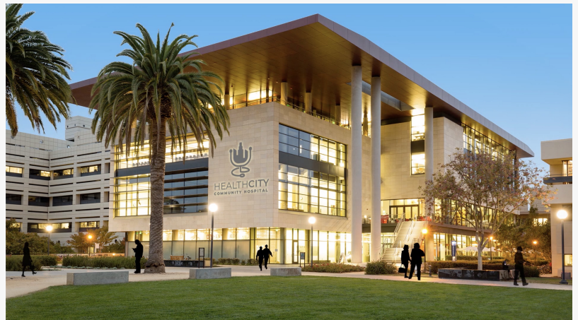
3D Hospital Campus Exterior

Scarritt Group's Virtual Conference Center was initially created in 2019, offering a lower-cost solution for budget constraints related to global travel and for meeting attendees that cannot travel. When the COVID-19 pandemic struck in 2020, Scarritt Group was well-positioned to transition their face-to-face meetings to virtual meetings.