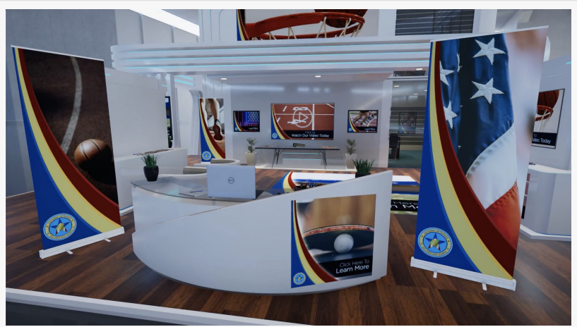
3D Exhibition Booth