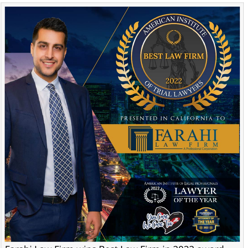
Farahi Law Firm wins Best Law Firm in 2022 award

The Farahi Law Firm has a long history of <u>success in personal injury cases</u> and has won some of the largest verdicts and settlements in California. The firm's commitment to justice and its clients has earned it a reputation as one of the best law firms in the