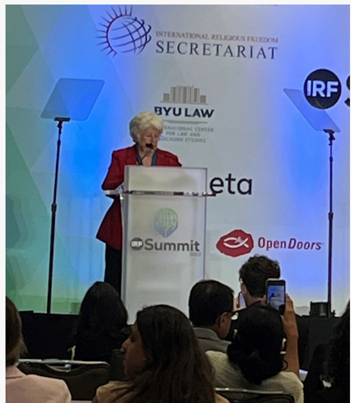
Rev. Susan Taylor addressing attendees at the 2022 International Religious Freedom Summit in Washington, DC

This press release can be viewed online at: https://www.einpresswire.com/article/582259690