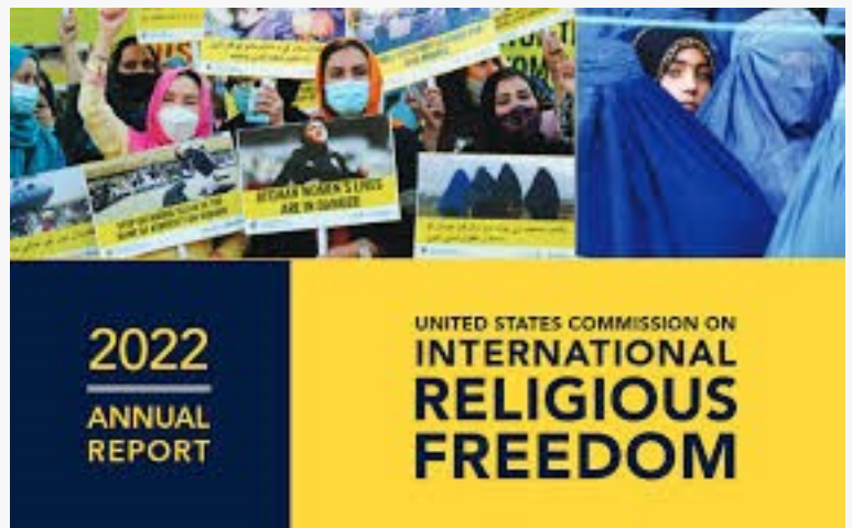
Cover of a USCIRF report on religious freedom issues