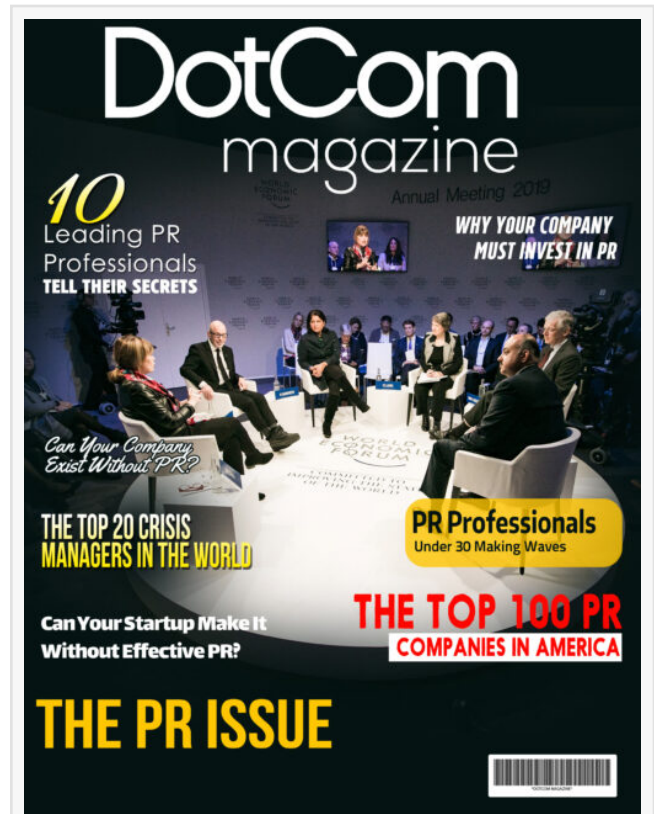
The DotCom Magazine PR Issue

DotCom Magazine is a leading news platform providing fascinating interviews with news makers, thought leaders, and entrepreneurs. DotCom Magazine is the leader in putting people with insatiable entrepreneurial spirit at the forefront of every story it covers. The Entrepreneur Spotlight Interview Video Series looks at business through the lens of a successful entrepreneur’s mindset. The Entrepreneur Spotlight Series has included high-profile leaders, including Inc 500 founders, Ted Talk presenters, ABC Shark Tank participants, venture backed visionaries, prolific CEO’s and Founders, and many other wonderful thought leaders and entrepreneurs. DotCom Magazine covers Founders and CEO’s making a difference. Regardless of who the entrepreneur is, where they live, or what they are doing, if it is interesting and newsworthy, DotCom Magazine covers it. In selecting entrepreneurs for this important video series, we consider the newsworthiness of the story and what our viewers want to learn about. If something is important to our viewers, it is important to DotCom Magazine. The people at DotCom Magazine believe in including a diverse range of entrepreneur voices in our interviews, and actively pursuing entrepreneurs making a positive difference in the world.