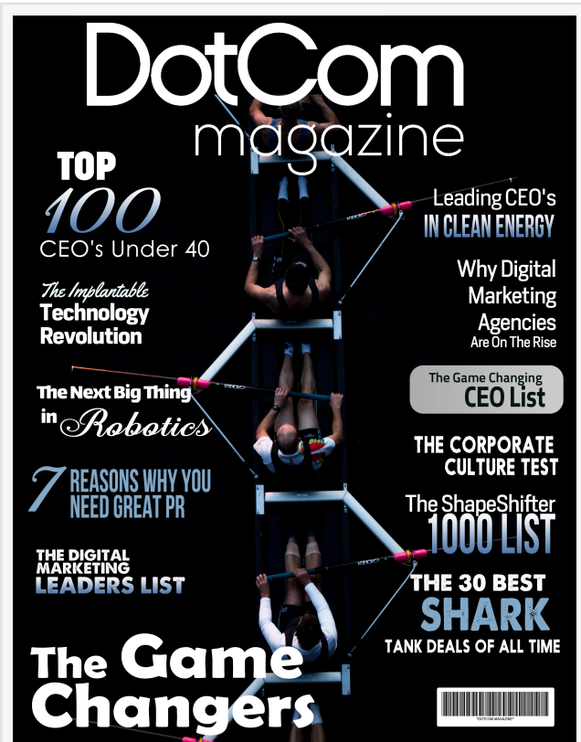
The DotCom Magazine Game Changers Edition