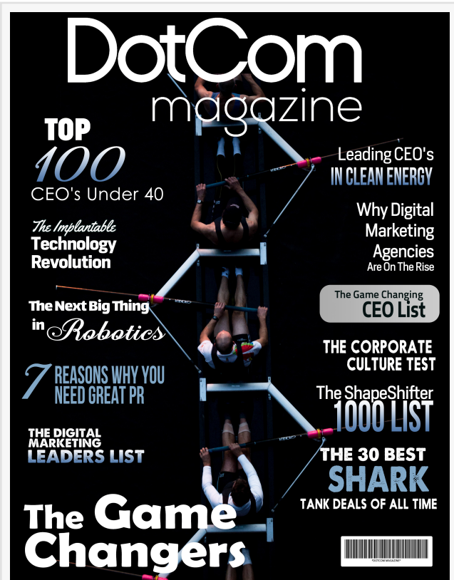
The DotCom Magazine Game Changers Edition