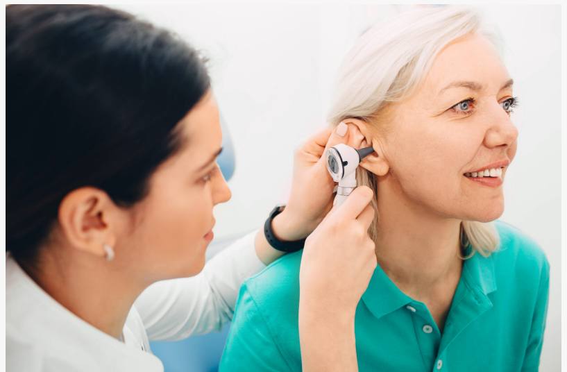
ENT specialist Northamptonshire