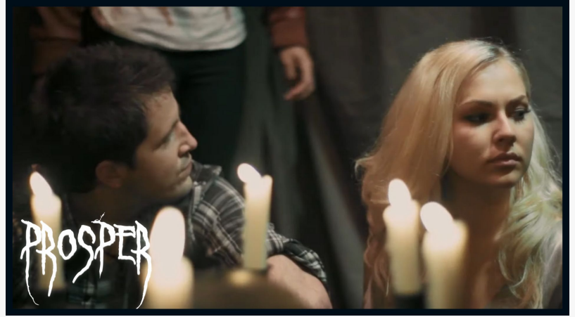
Prosper Screenshot 4