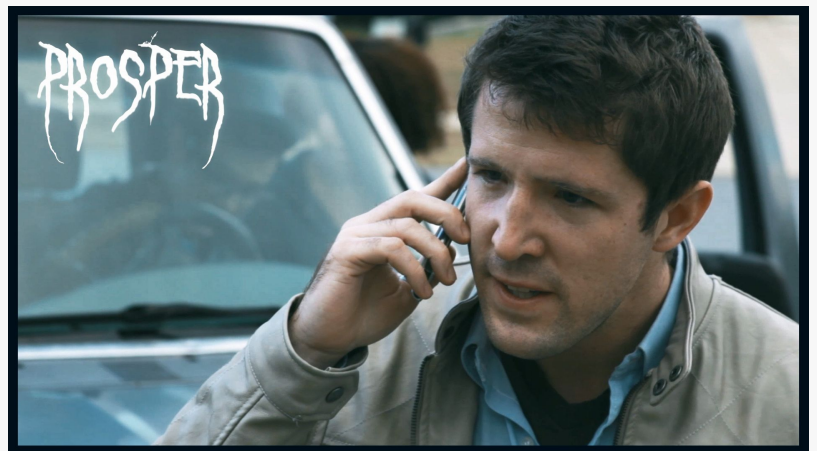
Prosper Screenshot 3