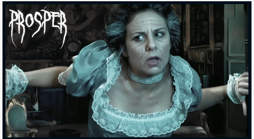
Prosper Screenshot 2