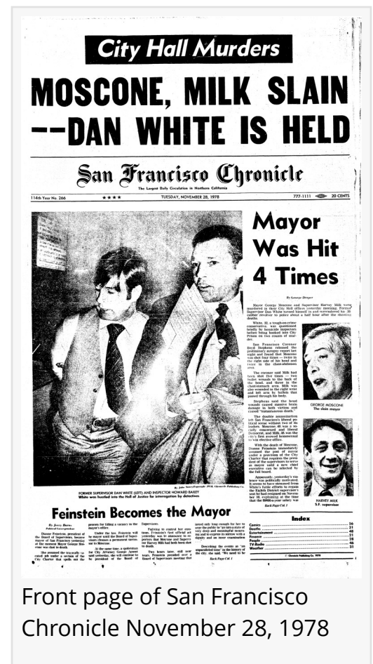
Front page of San Francisco Chronicle November 28, 1978