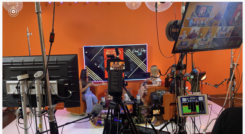
Behind the Scenes of Good Day Live