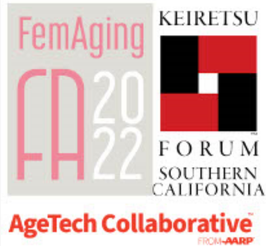
Partners of the event, FemAging Project, Keiretsu SoCal and AgeTech Collaborative