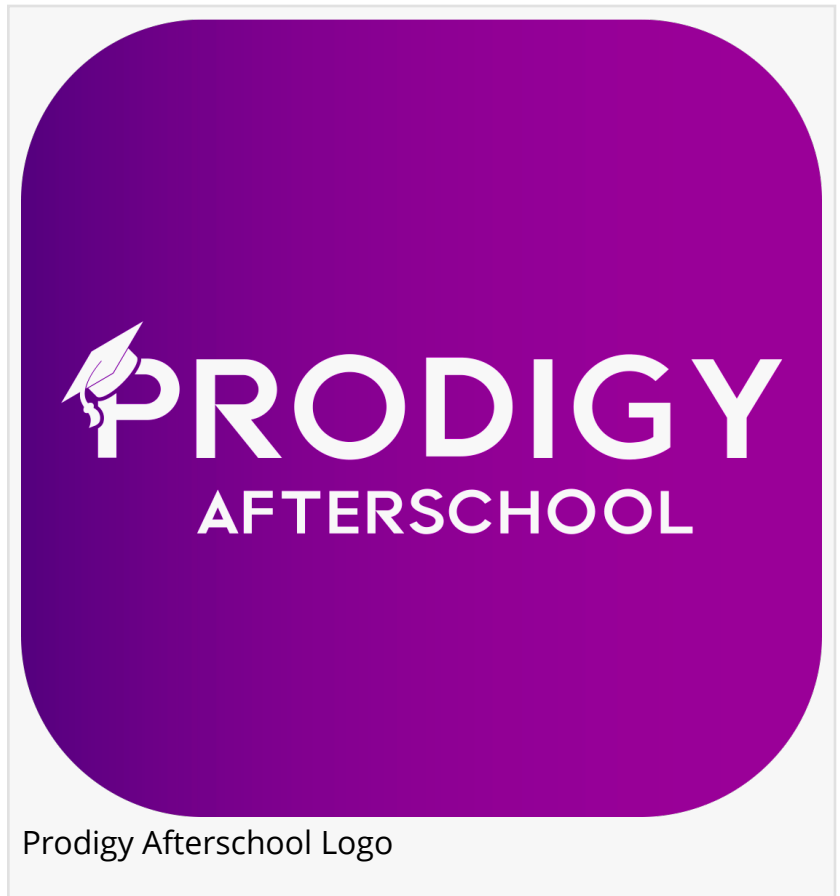
Prodigy Afterschool Logo

We have also created a series of arts-based masterclasses taught by some of the finest