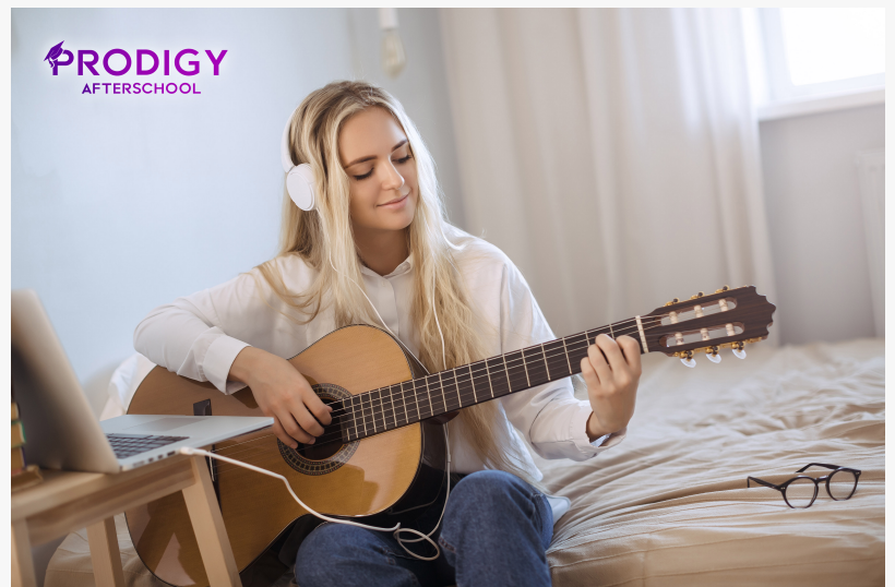
Student Learning Guitar at Prodigy Afterschool