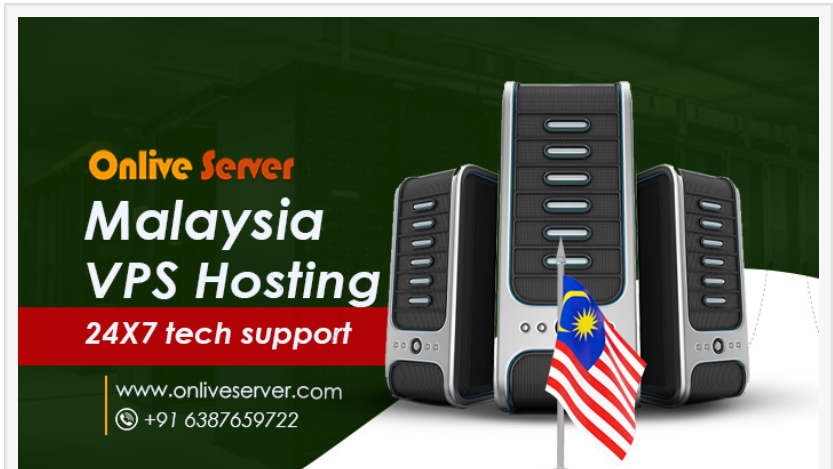
Malaysia VPS Hosting 1

In a virtual private server (VPS) environment, a physical server is partitioned into numerous virtual servers, each of which has its dedicated resources, including CPU, memory, and disc space. Virtual private servers (VPS) are completely isolated from each other, running precisely like a conventional server with full root SSH access. Since a single physical server may host multiple virtual private servers, the running expenses of VPS hosting are significantly lowered,