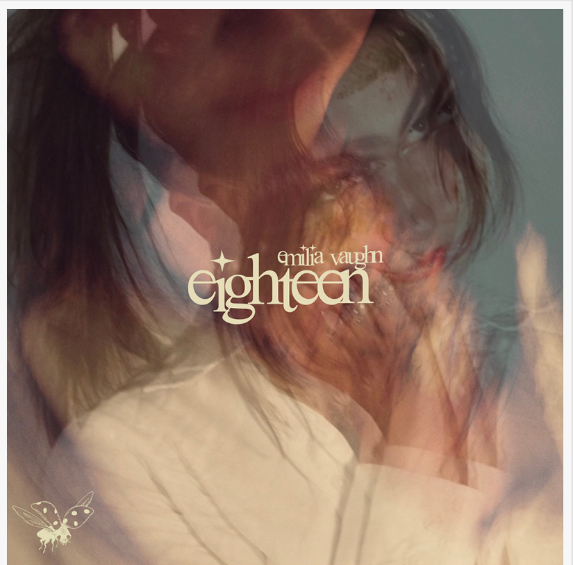
Emilia Vaughn - "Eighteen" Album Artwork