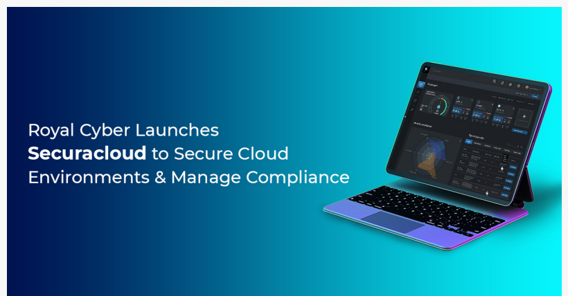
Royal Cyber Launches Securacloud to Protect Cloud Security and Compliance

Developed by our cloud security and app development experts, Securacloud helps companies stay on top of their regulatory compliance frameworks and tracks configurations on a microscopic level to ensure there are no vulnerabilities malicious third parties can exploit.