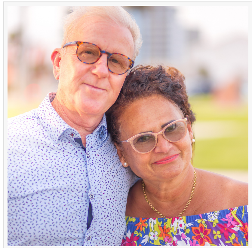
A couple on vacation from Brazil pose for a family photo session in downtown Corpus Christi, Texas.

On top of their commercial and editorial photography work there is still the family photography work that comes through the door and that is also a sign that people are spending