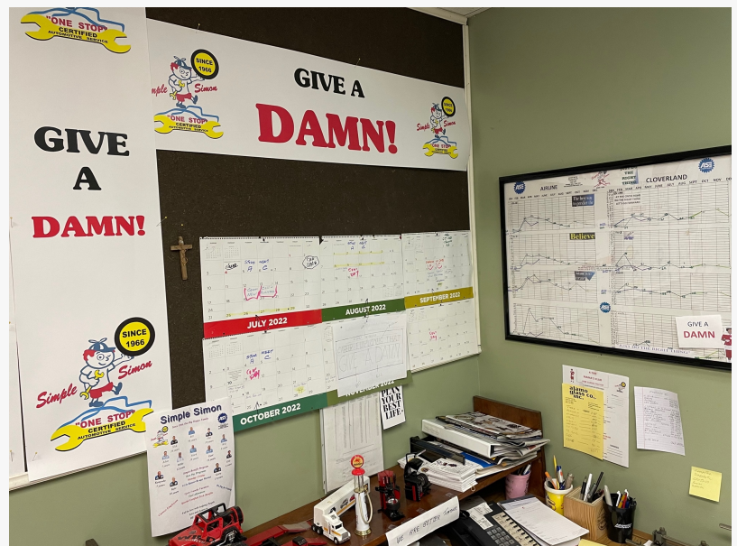
Following one of Lewis's motivational speeches, Simon immediately adopted the Give A Damn philosophy at Simple Simon Tire.