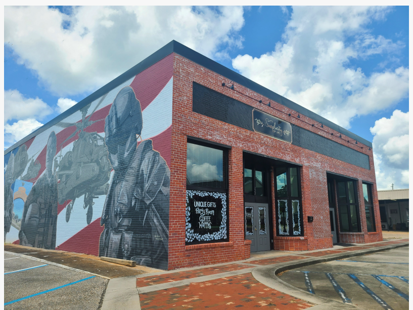
Status Co. Leather Studio Relocates to Downtown Enterprise, Alabama

Status Co. Leather Studio offers impeccable customer service online and locally. 'Our customers include leather enthusiasts, interior designers, artists, writers, and working professionals who