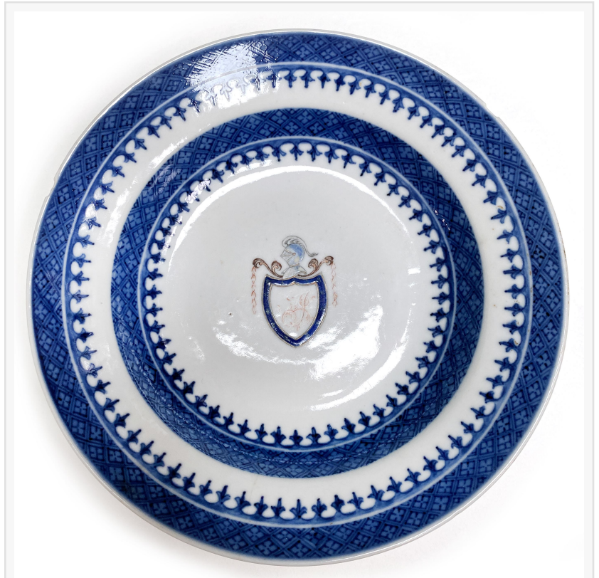
Thomas Jefferson's rare White House service china, likely a dessert bowl, a circa 1790s white Chinese export porcelain serving plate 6 ¼ inches in diameter (est. $15,000-$18,000).

He added, “Whether a hand-written letter from Abraham Lincoln, a signed first edition James