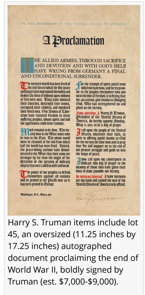
Harry S. Truman items include lot 45, an oversized (11.25 inches by 17.25 inches) autographed document proclaiming the end of World War II, boldly signed by Truman (est. $7,000-$9,000).