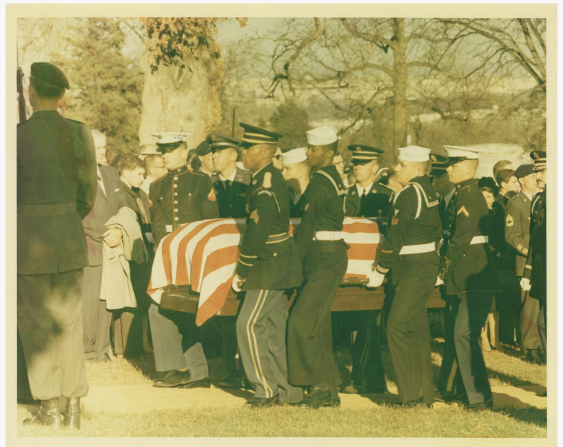
Lots 11-23 are all Cecil Stoughton original, first-generation John F. Kennedy photographs from JFK's funeral, 8 inch by 10 inch glossies, many of them featuring Jackie Kennedy and others.