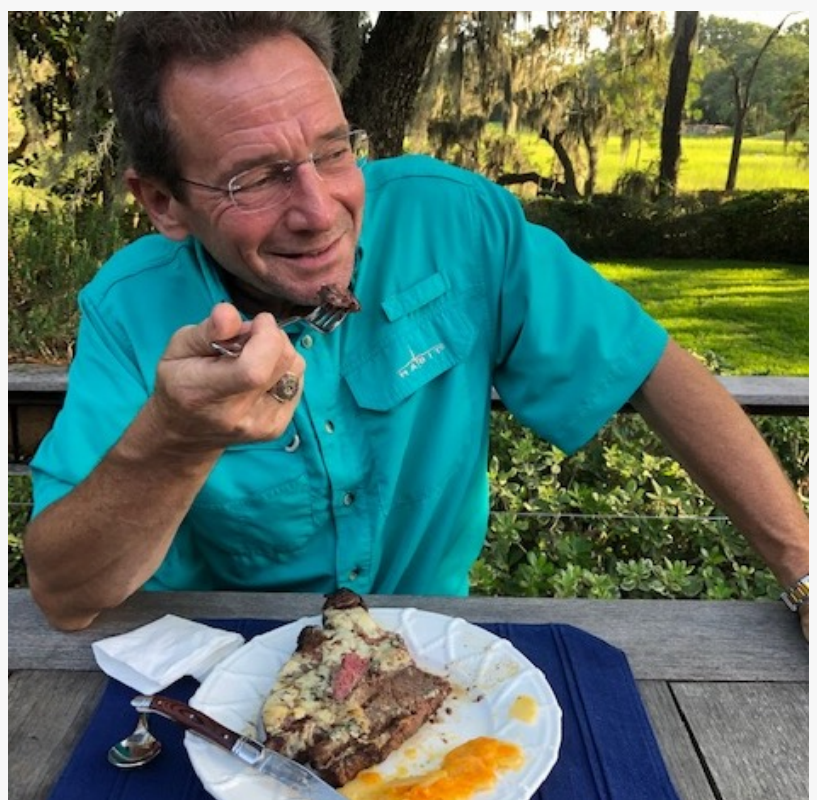
The Roadkill Art App is designed for the game meat lover.

Another first feature is the 'Regulations' page for checking roadkill rules and regulations for every US state and the District of Columbia, the only updated State-by-State Guide to America's