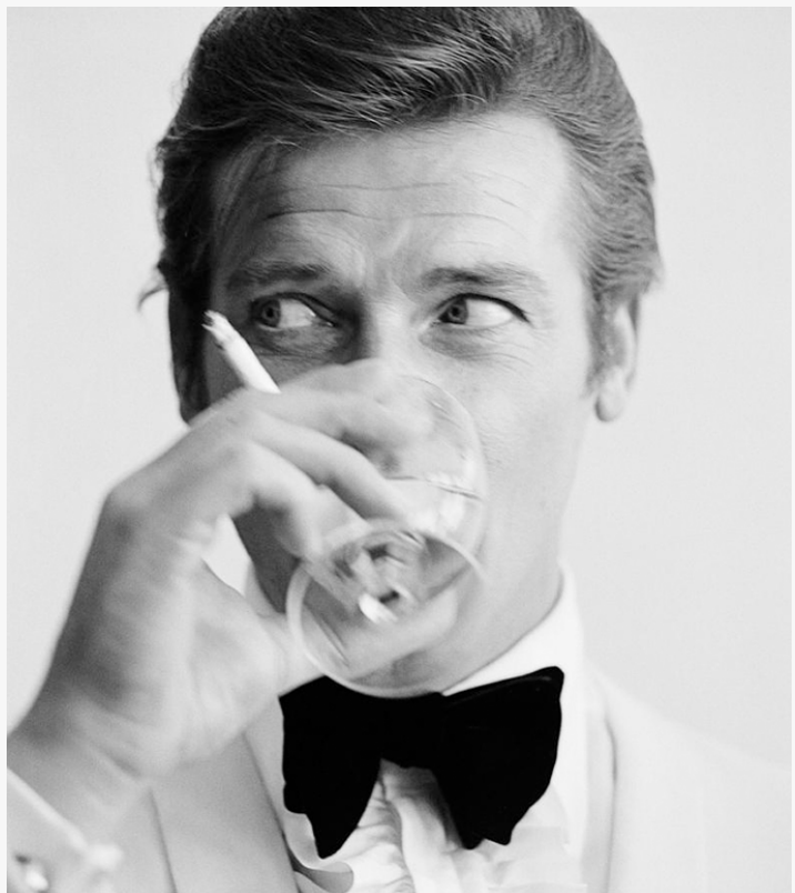
EnigmaFund - ARC iCMO and Strategic Advisor