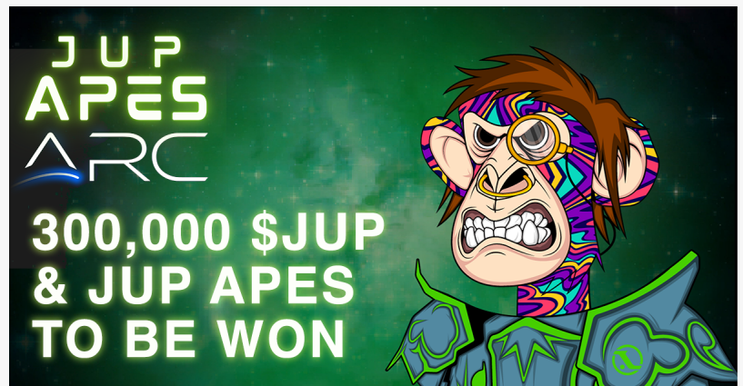
ARC NFT Marketplace 300,000 $JUP token Giveaway

MANHATTAN, NEW YORK, USA, July 26, 2022 /EINPresswire.com/ -- On the 25th July 2022, ARC NFT Marketplace launched, kicking off with its first partnership project: JUP Apes. To celebrate and promote the launch, ARC, JUP Apes and Jupiter Project have synergised on an array of airdrops, community giveaways and marketing strategies.