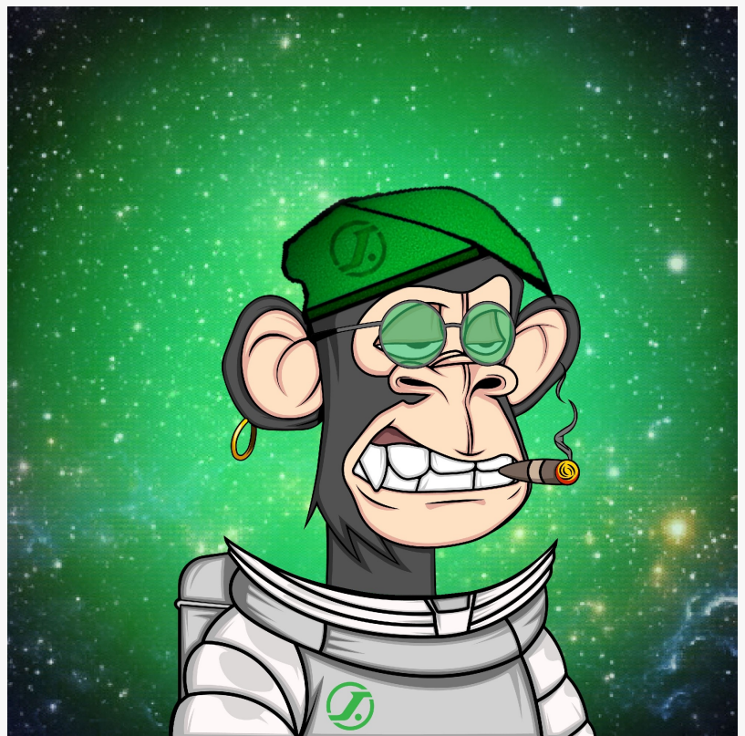
A rare Ambassador JUP Ape NFT can be identified by the green beret trait

ARC's proprietary NFT marketplace offers its partners an exciting array of features, one of which is lazy minting. Lazy minting benefits the project and creator as minting only takes place when an NFT sale occurs. This means that gas fees are charged to the user only at that point in time for the minting process. These kinds of advantages put the creators and users first, and reduce several barriers to entry such as steep