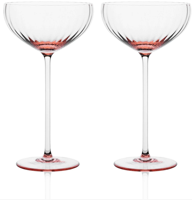
pink coupe glasses

Sister.ly Drinkware Customer Service Sister.ly Drinkware +1 224-360-1422 email us here