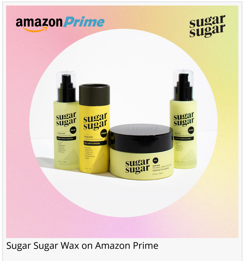
Sugar Sugar Wax on Amazon Prime

"With customers from Vancouver to Prince Edward Island, getting our products in the hands of our Canadian customers from California with high shipping rates and long delays at the borders was not how we wanted to start those relationships. Now with Amazon as a fulfillment partner