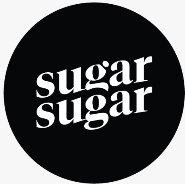
Sugar Sugar Wax logo

Amazon is guided by four principles: customer obsession rather than competitor focus, passion for invention, commitment to operational excellence, and long-term thinking. Amazon strives to