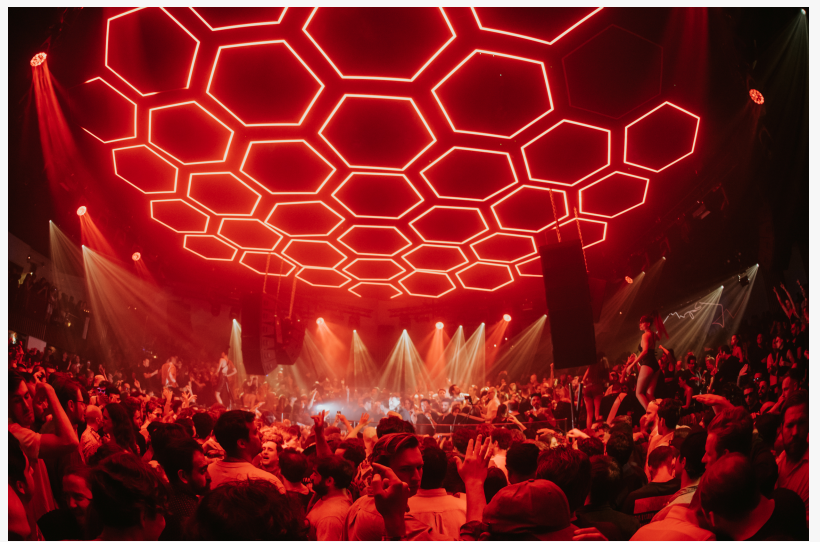
kinetic video rig designed by Audiotek for Pacha Ibiza

Pacha Ibiza encapsulates the latest in Nightclub design, taking these essentials to the extreme in