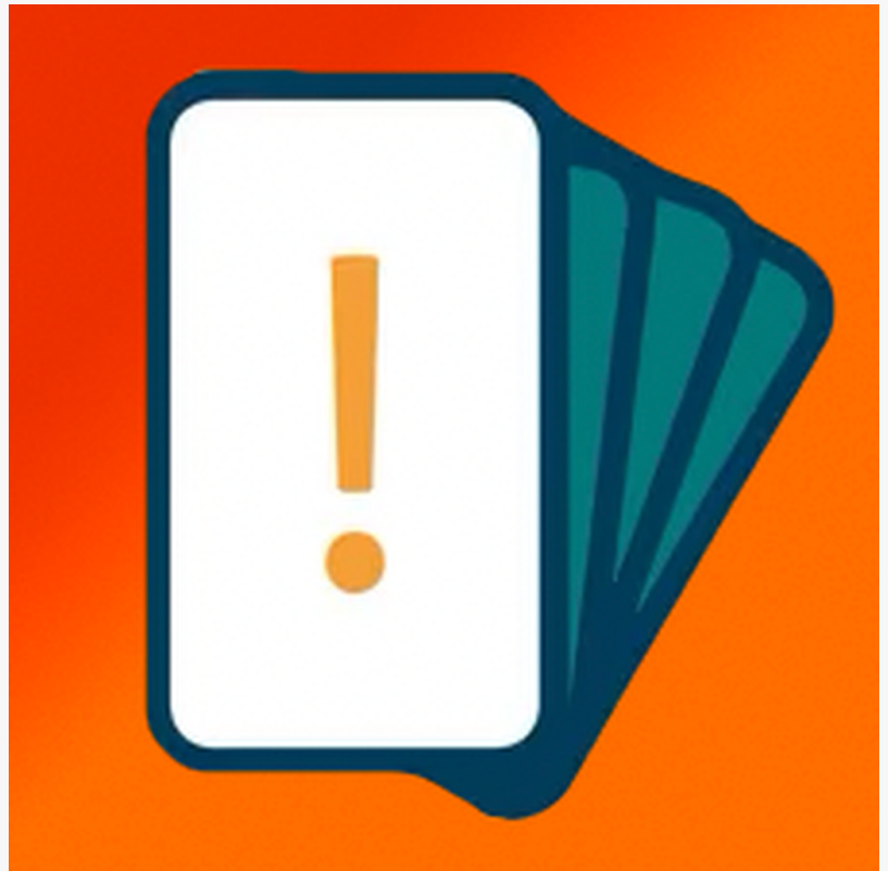
App Store logo for Protect Duty Cards

Those who download the app can answer up to 150 questions, all of which provide explanations