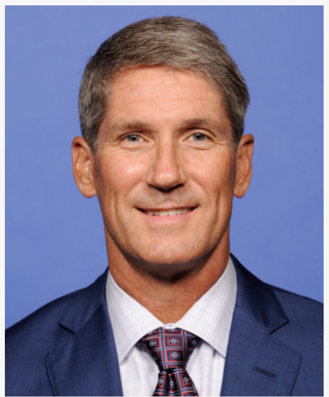
Rep. Scott Franklin

This press release can be viewed online at: https://www.einpresswire.com/article/583240094