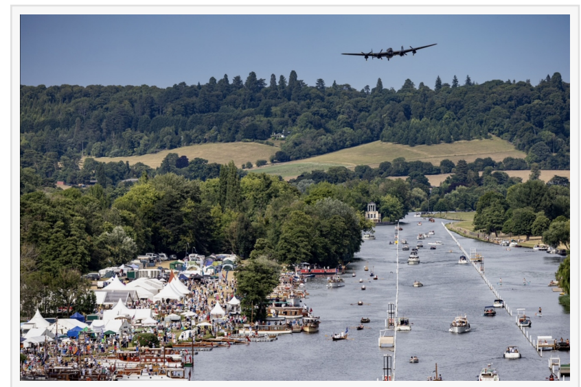
The abiding memory of the 43rd Thames Traditional Boat Festival - the flypasts of PA 474, the Battle of Britain Memorial Flight WW2 Lancaster bomber

By Tim Koch In 1993, the then Conservative Prime Minister, John Major, sought to reassure Eurosceptics