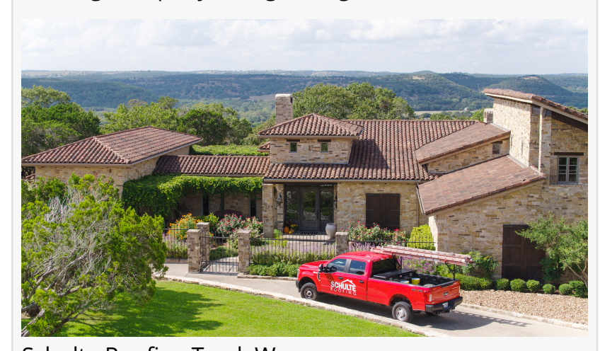
Schulte Roofing Truck Wraps

based in the Brazos Valley and provided services to the community. Schultes Roofing was nominated in the Best Roofing category.