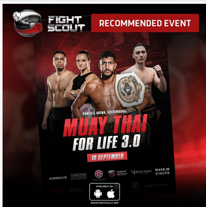
Fight Scout App Event

“With the Fight Scout App , you can connect and begin a conversation with a manager or promoter to offer your services as a fighter or vice versa within minutes. Having worked in the business for 20 years, going the traditional route, trying to get the attention of a manager or promoter is quite hectic. Instead, you can focus on building a network within a few clicks on Fight