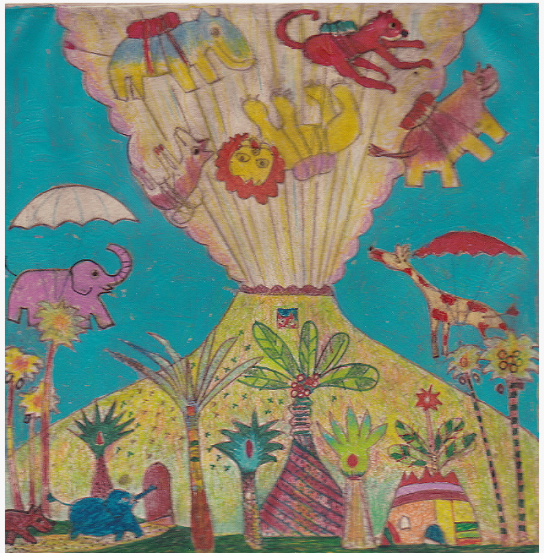
Animal Volcano - hand colored etching by Benson Seto