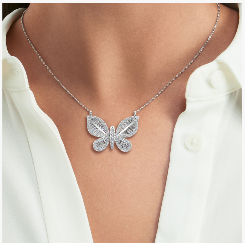
Butterfly Diamond Necklace