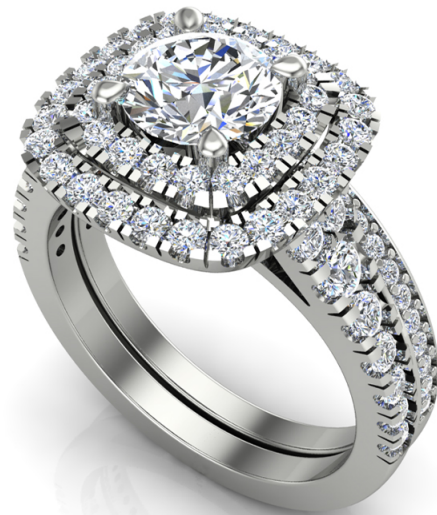
Cushion Diamond Wedding Ring Set