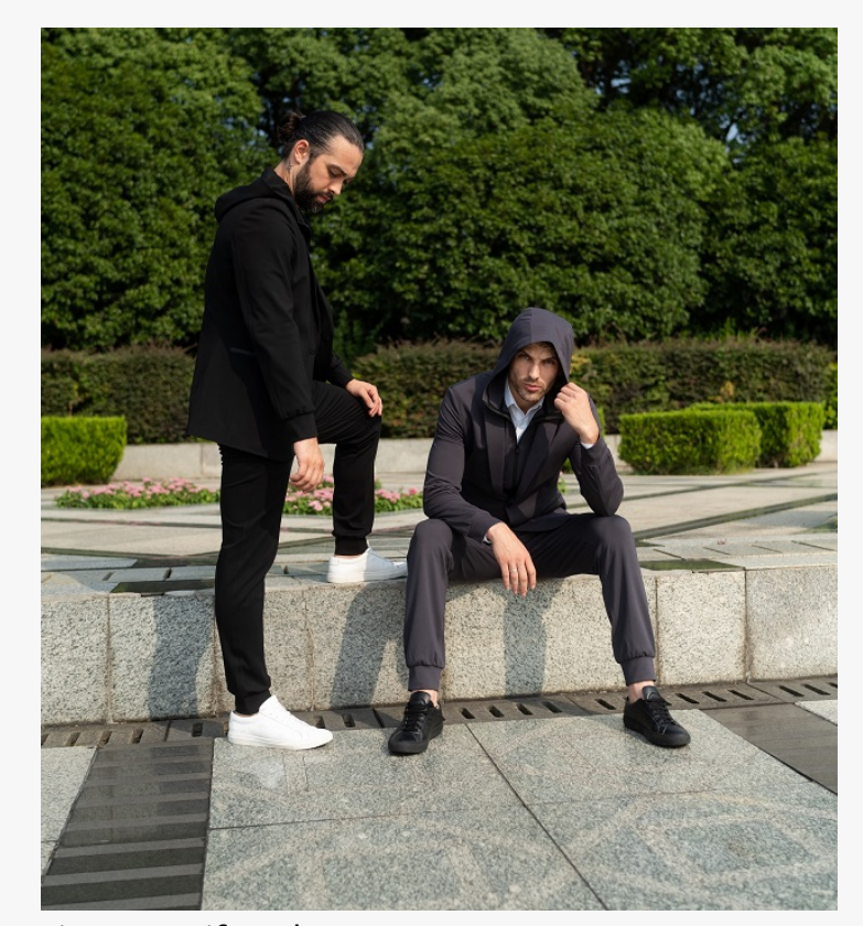
xSuit Sport Lifestyle