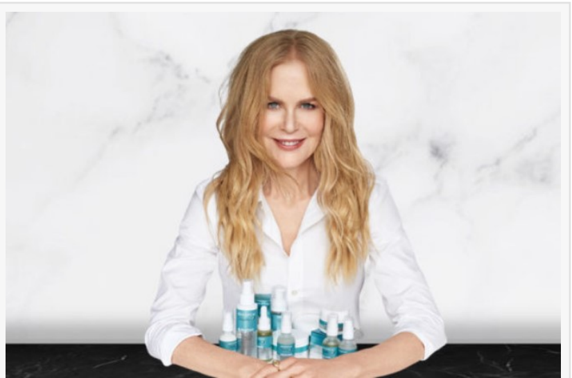
CURR & Nicole Kidman