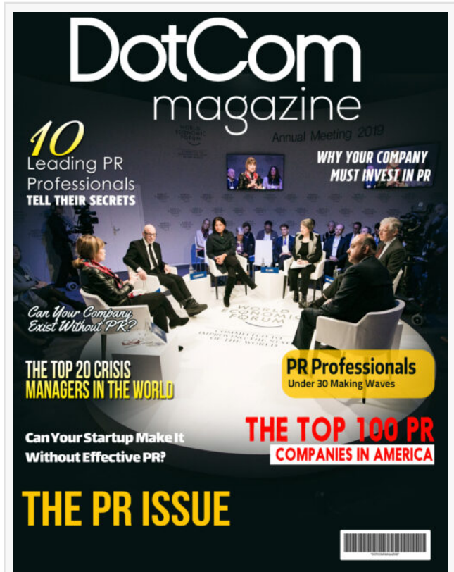
The DotCom Magazine PR Issue

DotCom Magazine is a leading news platform providing fascinating interviews with news makers, thought leaders, and entrepreneurs. DotCom Magazine is the leader in putting people with insatiable entrepreneurial spirit at the forefront of every story it covers. The Entrepreneur Spotlight Interview Video Series looks at business through the lens of a successful entrepreneur's mindset. The Entrepreneur Spotlight Series has included high-profile leaders, including Inc 500 founders, Ted Talk presenters, ABC Shark Tank participants, venture backed visionaries, prolific CEO's and Founders, and many other wonderful thought leaders and entrepreneurs. DotCom Magazine covers Founders and CEO's making a difference.