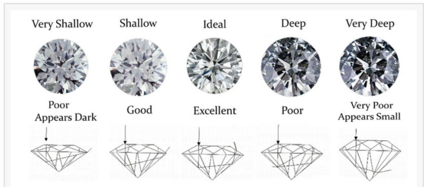
Cut of a Round Brilliant Diamond

The 4 Cs of diamonds are clearly detailed by a laboratory diamond report may it be from GIA or IGI. This gives you access to measurements of the dimensions of the diamonds and also intricate information about simulating light flow through a diamond. Table%, Total Depth%, Crown Ables and Pavilion angle determine how much of the light reflects back out from the table and the extent of the Fireball effect. The pattern of the light flow also tells you consistency of the light flow and delay of the sparkle.