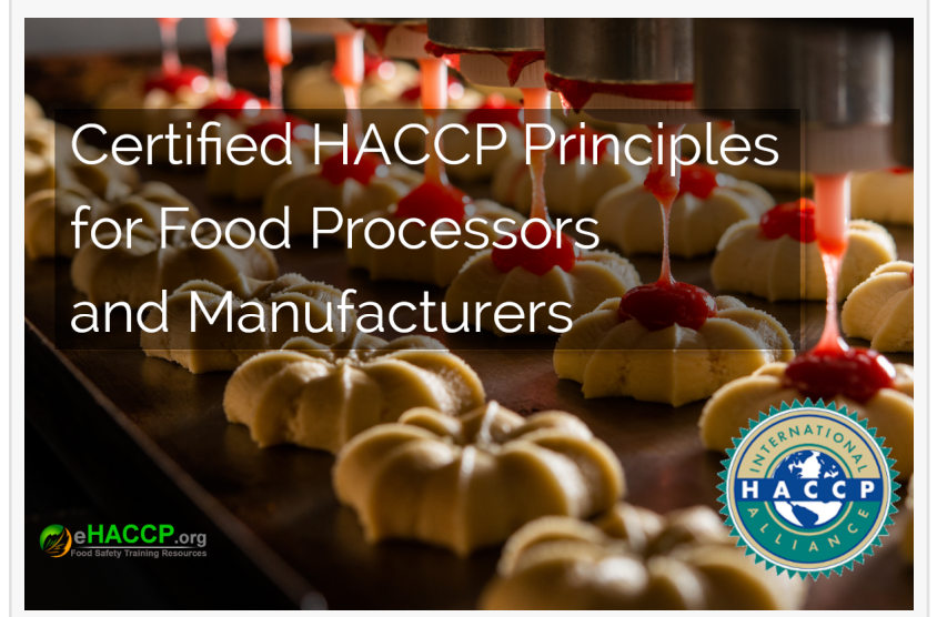
HACCP course name: Certified HACCP Principles for Food Processors and Manufacturers