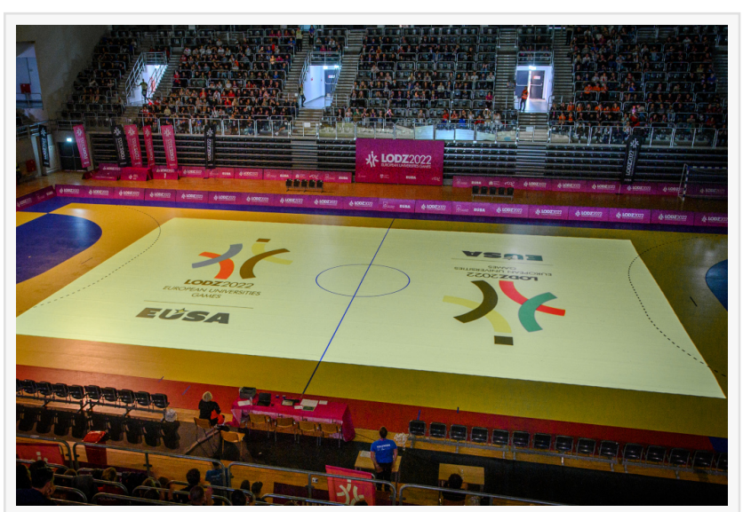
Closing ceremony of the European Universities Games EUG2022 Lodz

LODZ, POLAND, July 31, 2022 /EINPresswire.com/ -- The European Universities Games in Lodz, one of the largest multi-sport events in Europe this year, concluded after 15 days of competitions with a closing ceremony, held on Saturday, July 30, at the Lodz Sport Arena. The memorable event offered 20 sports, as well as a wide programme of educational, social and cultural activities. Te event was