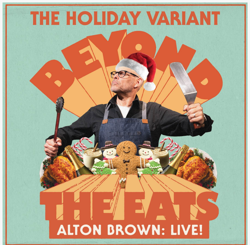
Source: Alton Brown Live