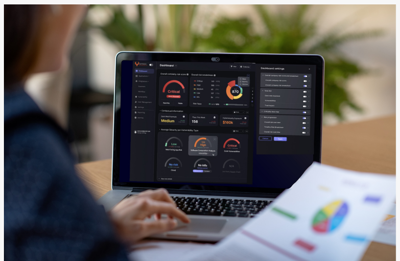
AppSec Phoenix Risk based Vulnerability Management Platform

This press release can be viewed online at: https://www.einpresswire.com/article/583977090