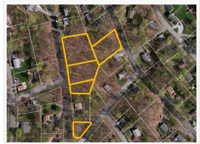
5 Lots Sold Together