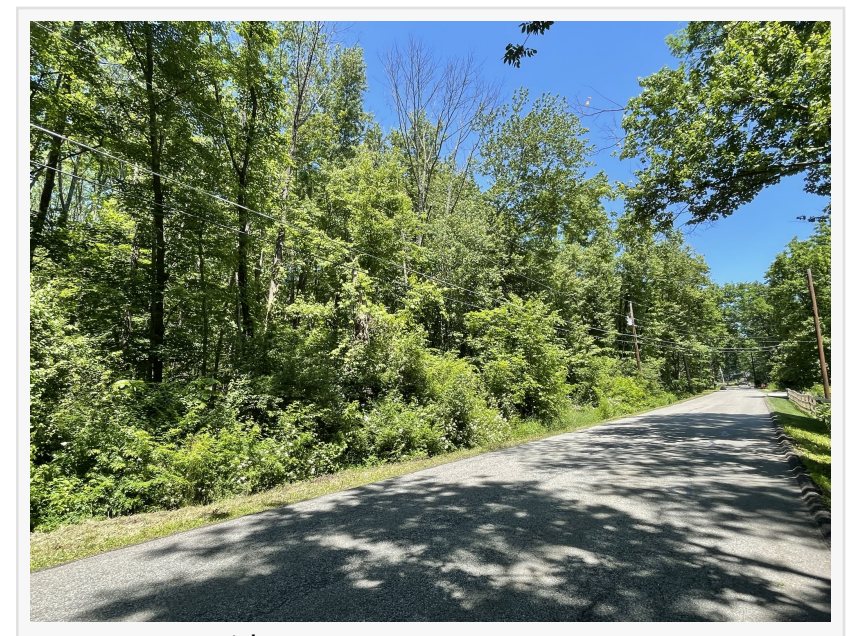
10+/- Acres with 747+/- Ft Frontage