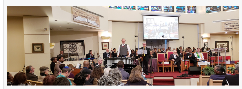
The Jazz Sanctuary brings live jazz music performances to audiences across the Greater Philadelphia region.

Friendship Circle, Cradle of Hope, Ronald McDonald House, Interfaith Hospital Center of the Main Line and Council on Brain Injury and Re-Med golf outing and therapy sessions.