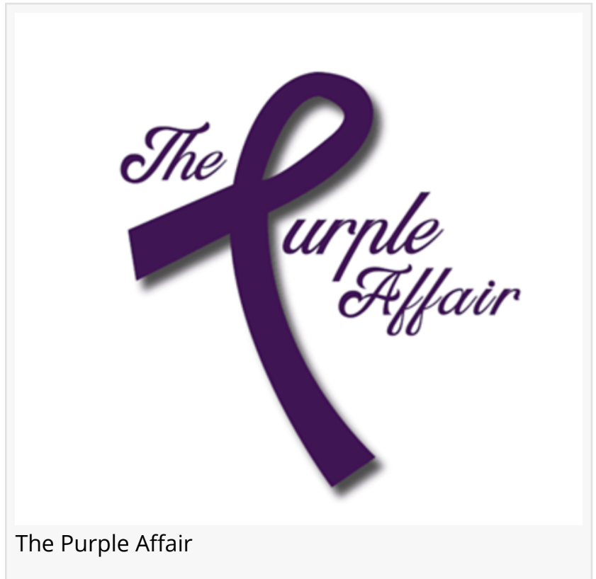
The Purple Affair