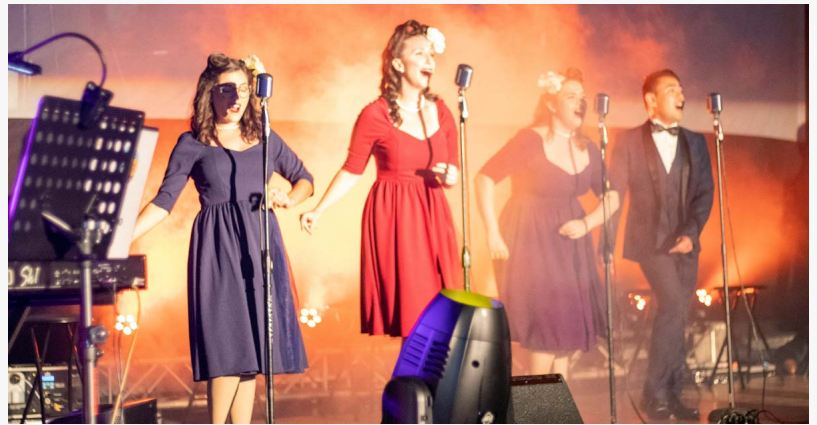
The jazz vocal group performing on the main stage

/EINPresswire.com/ -- The Swing Tones Return for Summer Swing Nights - 5th Anniversary