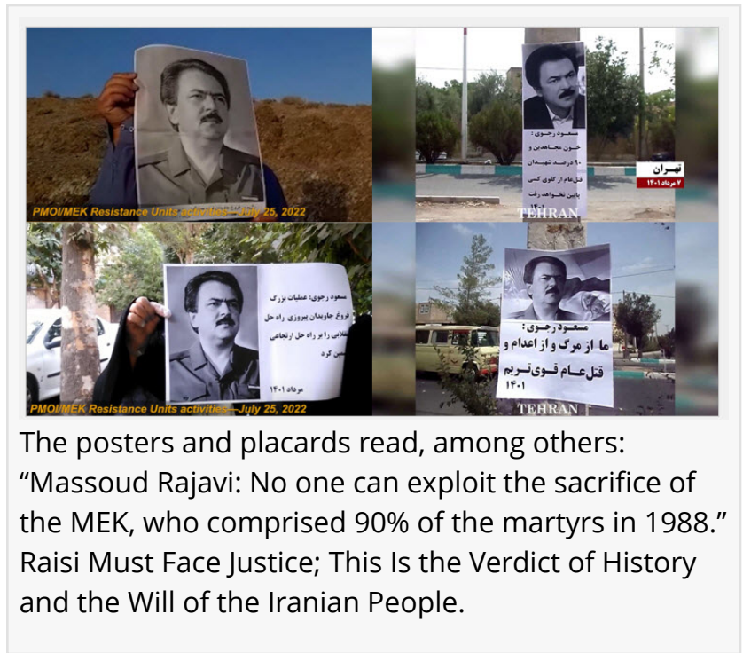
The posters and placards read, among others: “Massoud Rajavi: No one can exploit the sacrifice of the MEK, who comprised 90% of the martyrs in 1988.” Raisi Must Face Justice; This Is the Verdict of History and the Will of the Iranian People.

“Maryam Rajavi: The enraged people of Iran will not be satisfied with anything less than the overthrow of the regime,” “Maryam Rajavi: Seeking justice for the martyrs of the 1988 massacre is a patriotic duty,” “Raisi must face justice this is the verdict of history and the will of the Iranian people,”