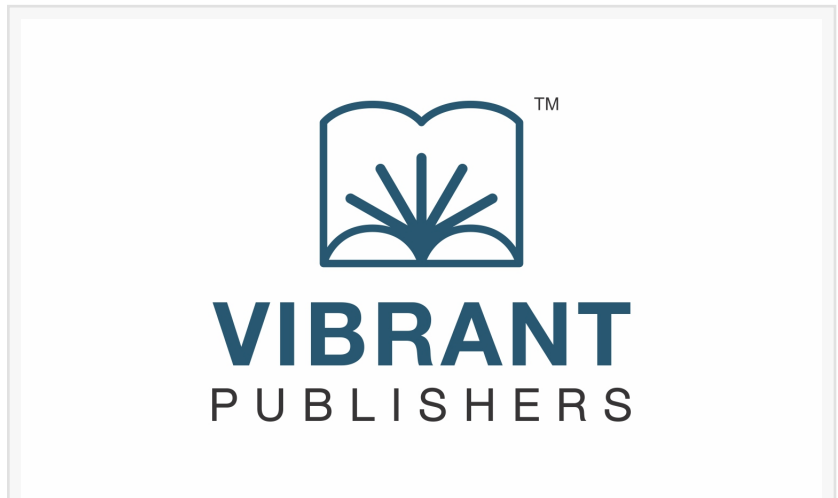
Vibrant Publisher's logo

The book also comes with an overview of the GRE General Test to give an insight into the format of the test and scoring parameters with tips and strategies to prepare for the final day. The book is filled with questions related to Analytical Writing, Verbal Reasoning, and Quantitative