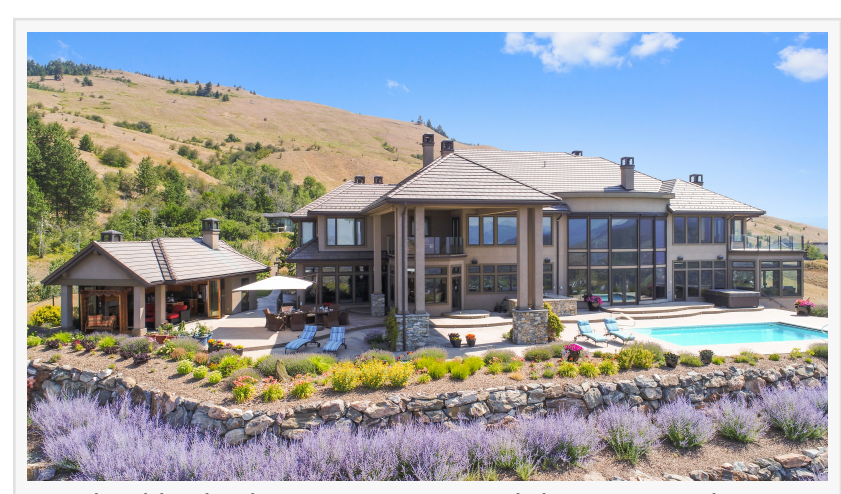
Perched high above two pristine lakes in British Columbia's #1 wine growing region, the awardwinning Okanagan Valley.

NEW YORK, NEW YORK, UNITED STATES, August 2, 2022 /EINPresswire.com/ -- The 14,000-plus-square-foot estate overlooking one of British Columbia's most picturesque valleys will auction this month via Sotheby's Concierge Auctions in cooperation with one of the area's top listing agents, Richard Deacon of Engel & Völkers. 133 Ravine Drive,