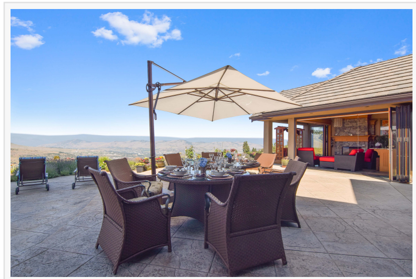
Relax in the pool and hot tub perfectly positioned to maximize the 180-degree south-facing views.

About Sotheby's Concierge Auctions Sotheby's Concierge Auctions is the world's largest luxury real estate auction marketplace, with state-of-theart digital marketing, property preview, and bidding platform. The firm matches sellers of one-of-a-kind homes with some of the most capable property connoisseurs on the planet. Sellers gain unmatched reach, speed, and certainty. Buyers receive curated opportunities. Agents earn their