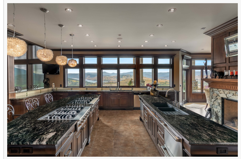
Sublime craftsmanship and luxury materials throughout are sure to impress, including American black walnut cabinetry and detailing, Swarovski crystal fixtures, and rare handcrafted antique palace doors from India.

133 Ravine Drive is available for showings daily 1-4PM by appointment.