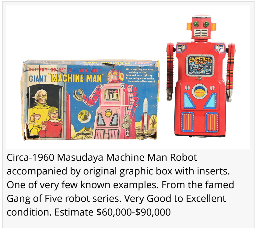
Circa-1960 Masudaya Machine Man Robot accompanied by original graphic box with inserts. One of very few known examples. From the famed Gang of Five robot series. Very Good to Excellent condition. Estimate $60,000-$90,000

The wide-ranging robot category features outstanding examples from the famed Simeone