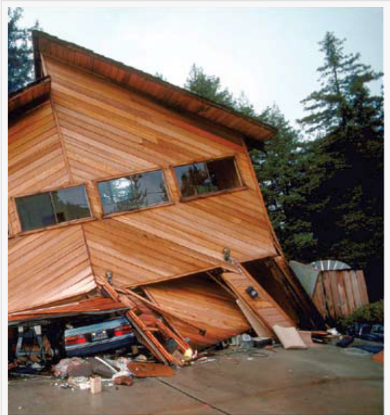
foundation repair in LA

Foundation Repair LA is therefore encouraging home and business owners in the area to have routine inspections of their foundations. The organization has expert structural assessors who