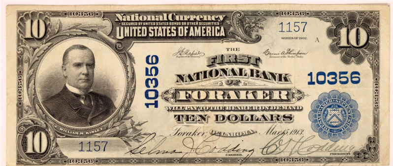
Large, newly discovered (and exceedingly rare) First National Bank of Foraker (Okla.) $10 bank note, circa early 1900s, graded a solid VF and boasting wonderful embossing and color ($4,458).