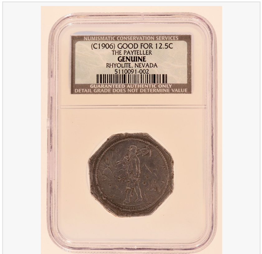
Octagonal token from the Rhyolite (Nev.) saloon (“The Payteller / 12 ½ c / Rhyolite, Nev.”), 30 mm diameter, with a graphic of a bearded miner with a pick, shovel and lunch bucket ($2,750).

A very rare octagonal token from the Rhyolite (Nev.) saloon (“The Payteller / 12 ½ c / Rhyolite, Nev.”), 30 mm in diameter, with a graphic of a bearded miner with a pick, shovel and lunch