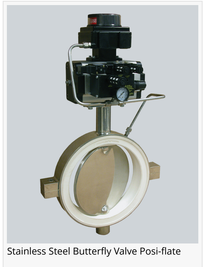
Stainless Steel Butterfly Valve Posi-flate

Dryer Type Valve applications such as Damper Valve Handling Pharmaceutical Powders in a Fluid Bed Dryer. Spray Dryer Discharge Valve for Handling Silicone Powder. Filter Dryer Discharge Valve for Handling Pharmaceutical Powders. On/Off Valve Handling Acidic Air from a Spray Dryer. Spray Dryer Discharge Valve for Handling Maple Brown Sugar. Dryer Inlet Valve for Handling Various Pharmaceutical Powders.