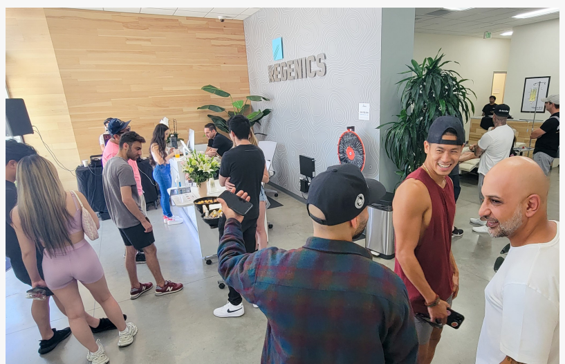
Regenics Health Event

TARZANA, CA, UNITED STATES, August 8, 2022 /EINPresswire.com/ -- Most medical providers are focused solely on treating disease symptoms instead of looking at the underlying causes of illness. There isn't as much focus on preventing disease as there is on simply treating the symptoms. Patients often recognize that something is wrong but they have to argue with their primary care physician to find out what the underlying problem really is. Most physicians just want to address the symptoms. They aren't focused so much on preventing illness, which is unfortunate for patients.